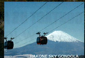
HAKONE SKY GONDOLA